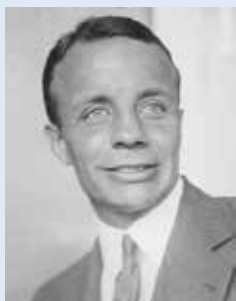
Lt. Col. Theodore Roosevelt Jr.

On the Legion's national website, it lists a Temporary Charter Date of 06/23/1919 for Post 10 Boulder. It also shows a Permanent Charter Date of 08/25/1921. This small anomaly did not go unnoticed.